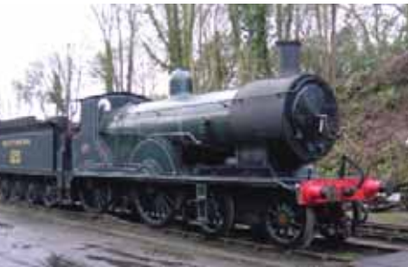
LSWR "T9" Np 30120 is one of two historic locomotives belonging to the National Railway Museum and stabled on our Railway.

Re-signalling the line began with the rebuilding of the signal box and frame. Installing signals, point rodding, signal wires and track circuits is ongoing. Restoration projects completed include GWR "Prairie" No 5552 and "West Country" class Wadebridge . Currently under way in 2008, projects include a Mk1 coach, an 0-6-0ST "Austerity" a "Toad" brake van, and the Port of Par locomotive Judy which, with its partner locomotive Alfred (which also runs on our railway), were the inspiration for Bill and Ben in the Thomas the Tank Engine books.