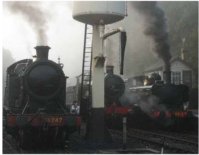
We have 6 running steam locos and a steam crane. 0-4-0 Judy and 0-6-0 "Austerity" are still in restoration. We also have a splendid collection of classic diesel locos. The photo includes visiting loco City of Truro getting ready for the day's work at Bodmin General - Steam Gala 2004.